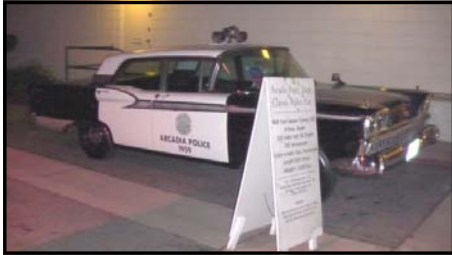
The City's 1959 police car.

Ranging in age from 13-years-old to over 80, the culturally diverse attendees of the One Community, One Book program presented by Arcadia’s Best on Friday enjoyed socializing, a potluck dinner, free insulated Shop Arcadia bags provided by the City of Arcadia, and free bookmarks and buttons.