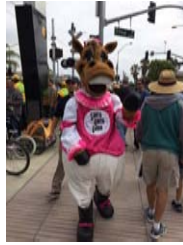
OPENING DAY at the METRO GOLD LINE