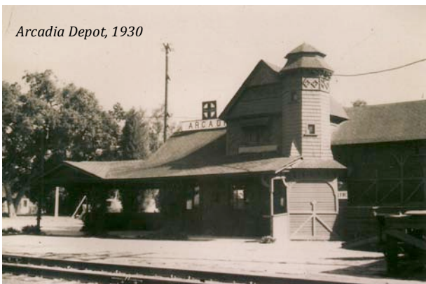
Arcadia Depot, 1930